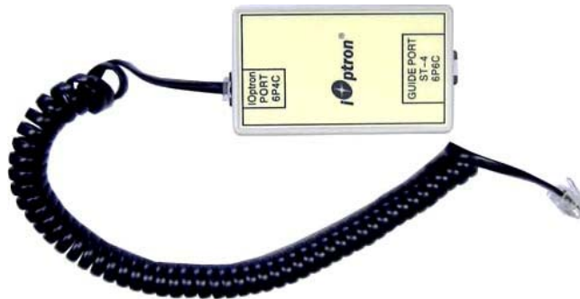
Figure 1. ST-4 adapter and cable

ST-4 Adapter has two ports, as indicated in Figure 1: iOptron Port and Guide Port. Connect one end of supplied 6P4C coiled cable to the iOptron Port of the adapter. Plug the other end into an available HBX port (Port A or Port B socket on the mount.) Connect Guide Port to ST-4 compatible autoguiding equipment using a 6P6C RJ-12 cable (not included).