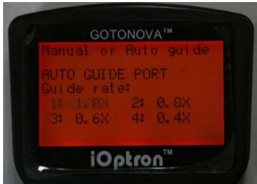
Figure 2. ST-4 adapter is connected